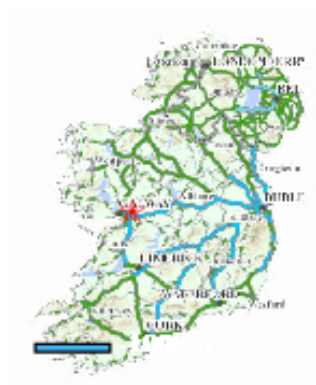
(c) Ordnance Survey Ireland Scales are approximate only